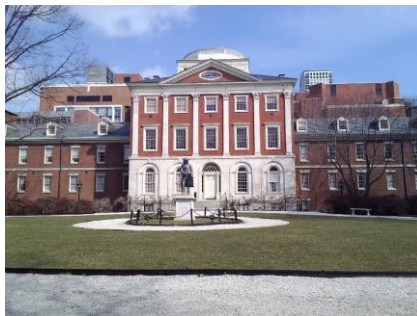
Pennsylvania Hospital- the oldest hospital in the States